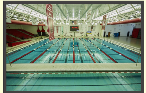
Waukesha South High School Natatorium featuring Optec Lighting.

We are not just your parts shelf. We are your working partner.